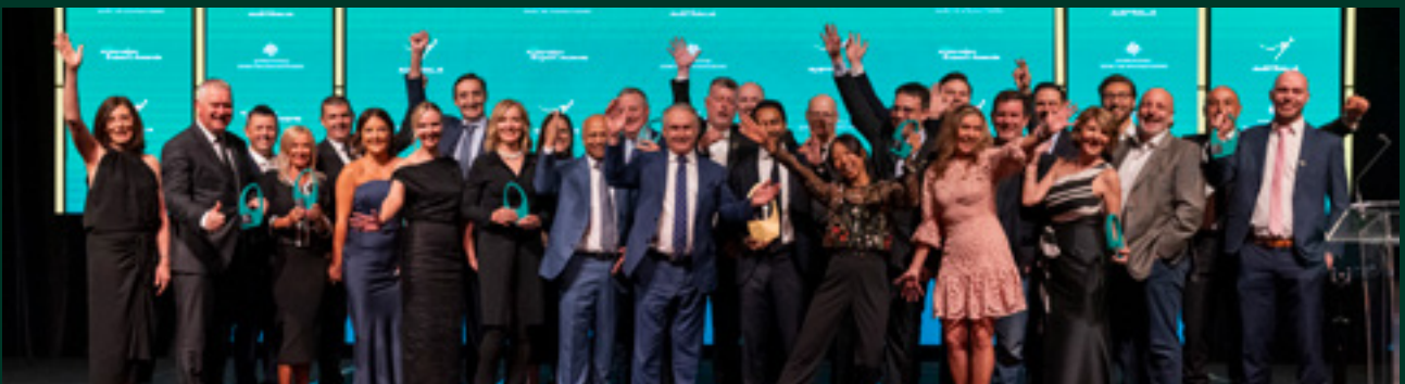
Pictured, the 2023 Australian Export Awards winners with Senator the Hon Don Farrell, Minister for Trade and Tourism.